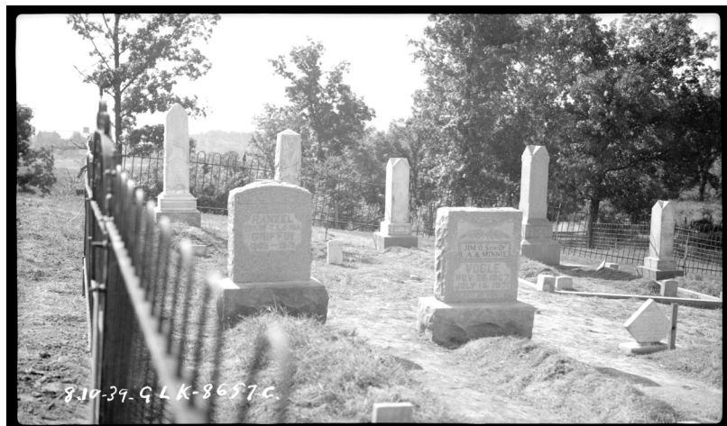
Hickory Grove Cemetery, southeast corner, 1939