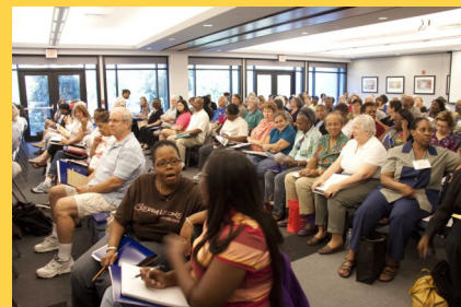
Every seat was taken!