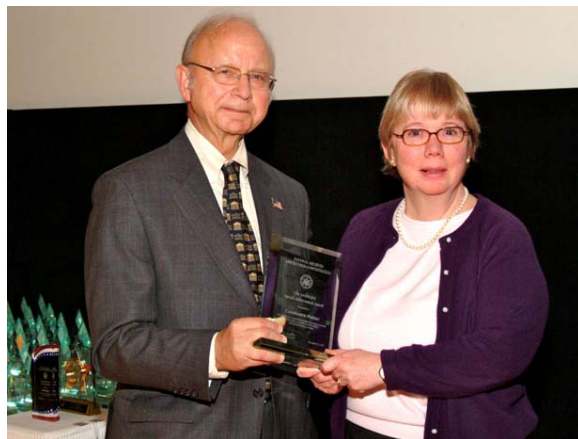
In 2007, she received the Archivist Award from then Archivist of the United States Allen Weinstein for educating and mentoring NARA staff, volunteers, and the public about family history records.

She will also talk about series on microfilm and online and the differences in both approaches.